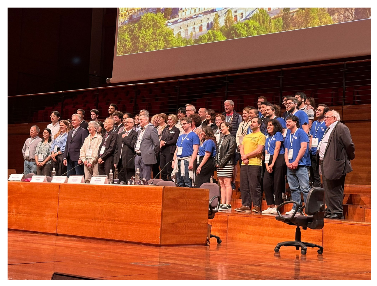
Figure 5: Organization Team

Altogether, I was very happy with the whole conference, and I am looking forward to the next LREC 2025 and the COLING 2026.