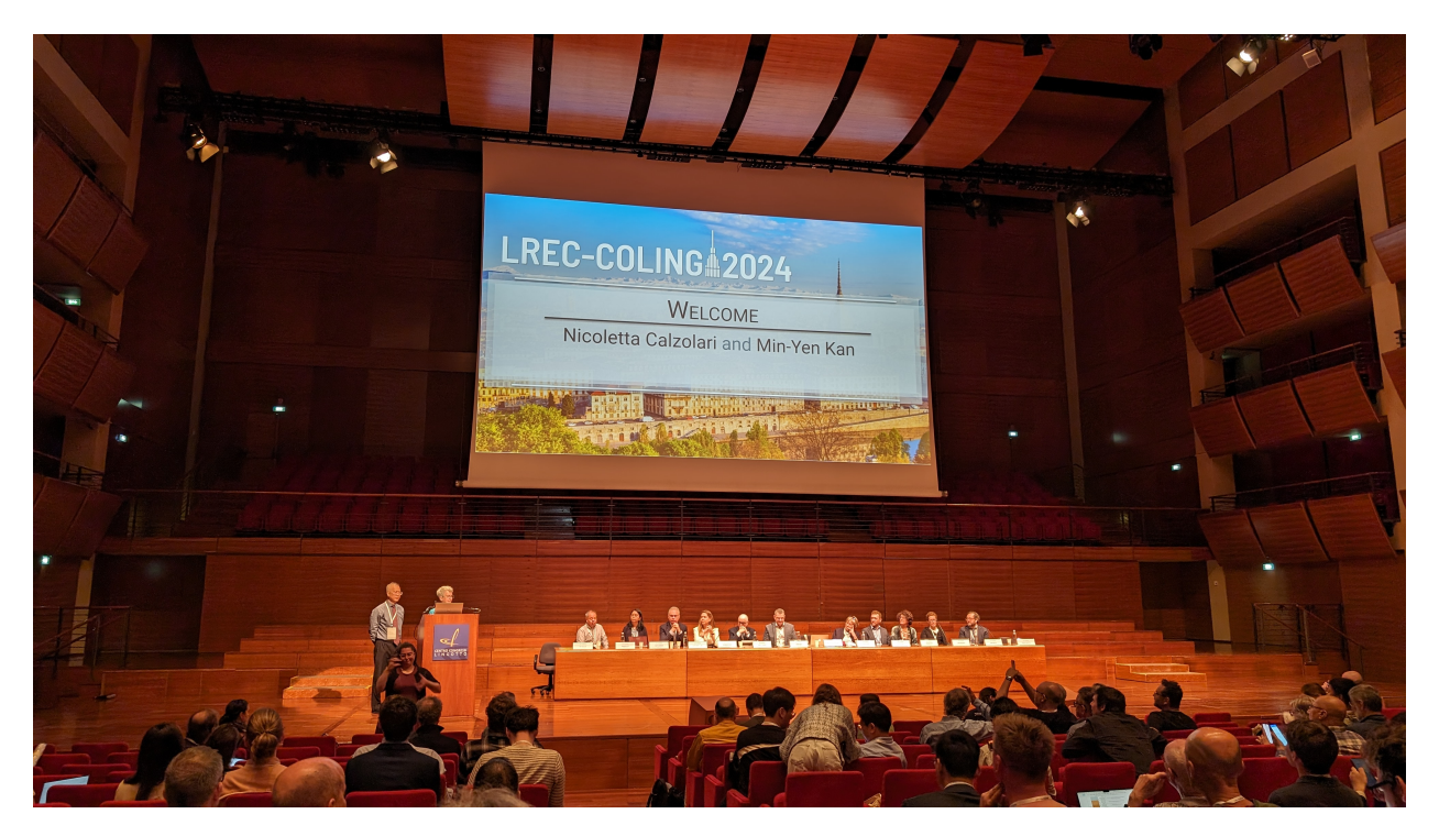
Figure 1: Plenary Session

End of May 2024, I participated in the Joint International Conference on Computational Linguistics, Language Resources and Evaluation (LREC-COLING) in Turin. Both COLING and LREC enrich the landscape of competitive conferences to publish in natural language processing and computational linguistics. While ACL, EMNLP, NAACL and EACL have a tendendency to aim at focusing on accepting high impact papers, also by keeping the acceptance rate low (~25%), both COLING and LREC are traditionally more inclusive. COLING and LREC recently had acceptance rates around 28% and 65%, respectively. While COLING also has been a bit higher in the past, these numbers are generally pretty typical for these venues.