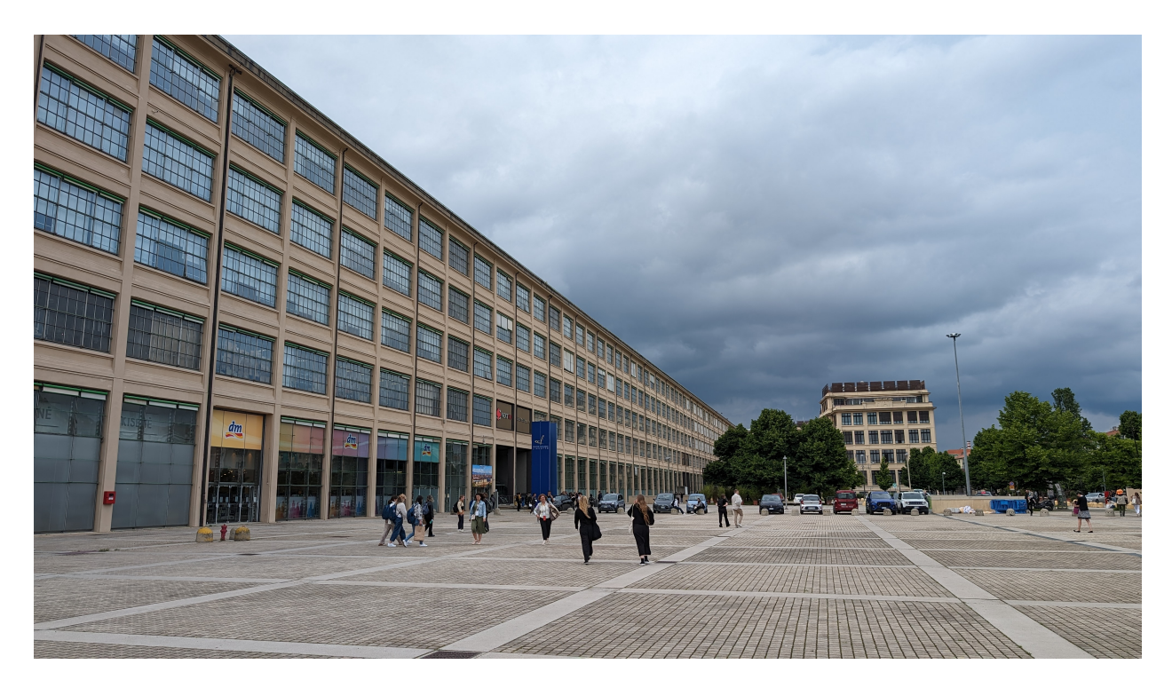
Figure 4: Lingotto