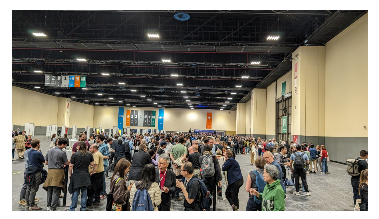
Figure 2: Poster Session

Due to his experience, nearly everything went very well with the tutorials, as far as I can say. We did select a good set of tutorials who attracted people from various areas. We received 20 submissions from which we selected 13 to be taught at the conference. Out of those three were introductory (one to an adjacent topic), and the majority presented cutting-edge topics. Unsurprisingly, a popular topic is large-language models, which are covered by multiple tutorials with varying perspectives on multimodality, evaluation, knowledge editing and control, hallucination, and bias. Other tutorials cover argument mining, semantic web, dialogue systems, semantic parsing, inclusion in NLP systems, and applications in chemistry. You can find the tutorial summaries at Klinger et al. (2024). I did attend two tutorials, one on knowledge editing and one on recognizing and mitigating hallucinations.